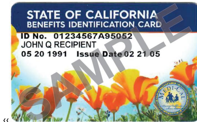
Figure 3: Front of BIC printed in full color without sex indicator>>