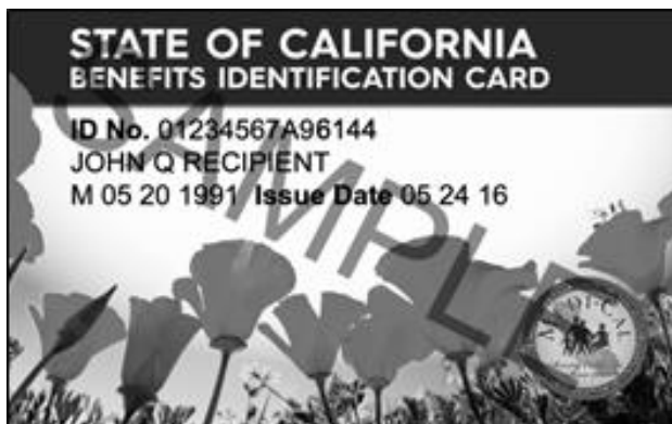
Figure 2: Front of BIC printed in full color with sex indicator»